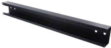
Top and Bottom Bracket QTY: 2