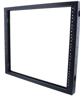
Mounting Profile QTY: 1