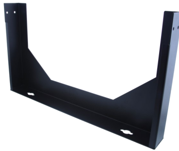
Side Bracket QTY: 2