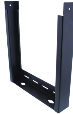
Side Brackets QTY: 2