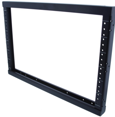
Mounting Profile QTY: 1